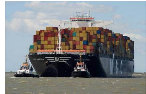
mv MSC Savona (May 2011)