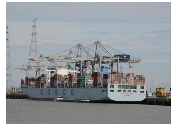
mv Cosco Belgium (April 2013)